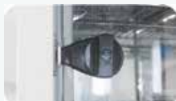
Glass Lock Group