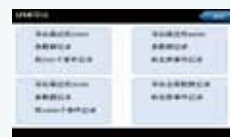
USB Export Interface