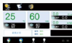
Operating Main Interface