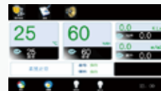
Operating Main Interface