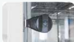
Glass Lock Group