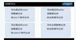
USB Export Interface